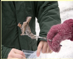
BTM Webs Clipped